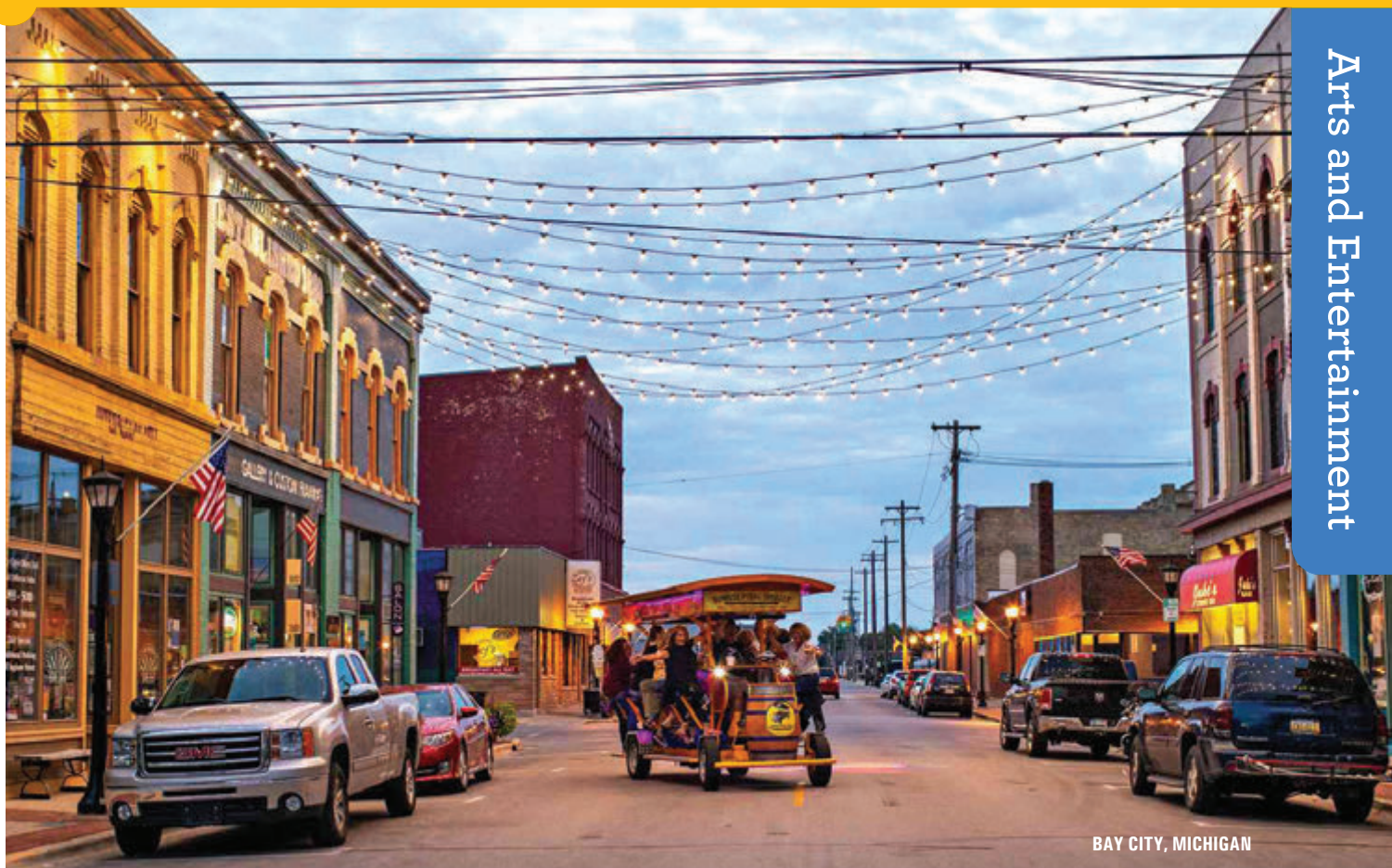
BAY CITY, MICHIGAN